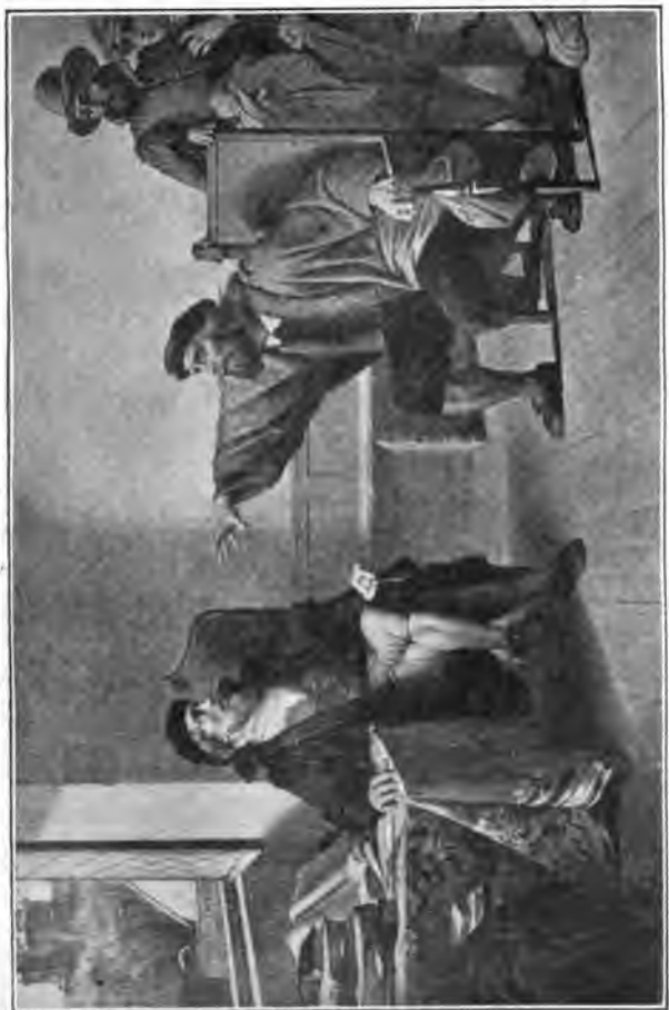
FAREL'S CALL TO CALVIN Calvin is to the Left, Farel to the Right. Out the Window is the Cathedral in which they Preached